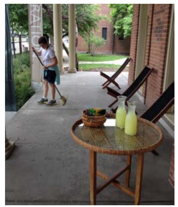
Preparing for a day of Porch activities

"The first meetings [to plan the Porch Project] were very meandering," noted Marks. "We ate together; we lingered; we listed several options for possible projects, all of which were counter-intuitive to [what the staff saw as their] strengths. In the end, a desire to challenge insularity became the running thread. [They asked questions like:] What if we took the time to engage directly the community's different points of view? Hull-House staff hold their curatorial value so preciously—I mean, they feel strongly that they have things to say, but are they so principled that it also makes them difficult partners? What if they invited the community to just hang out, and chat, and drink lemonade without any predetermined outcome in mind? [The concept of] slowness by itself didn't convince anyone, but as an idea attached to their working process, it made sense."