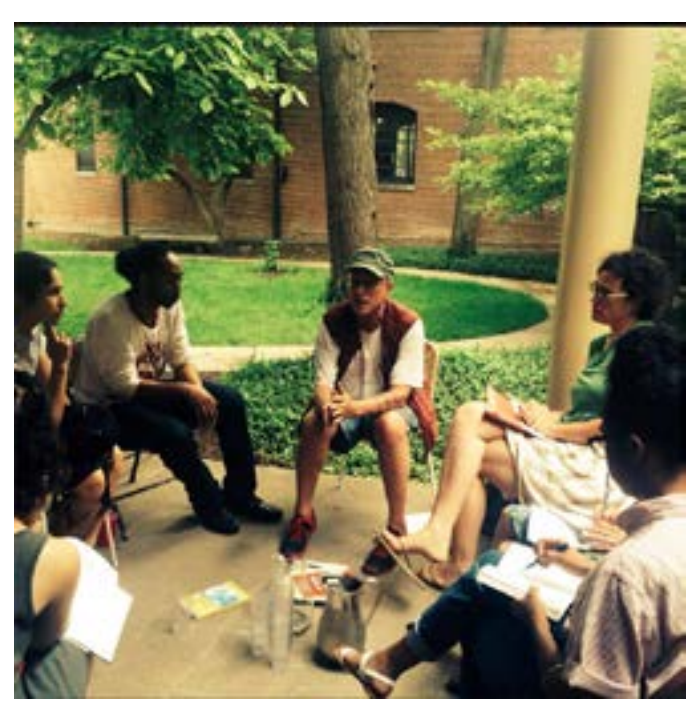
Hull House offered dialogues about immigration on the front porch for public audiences