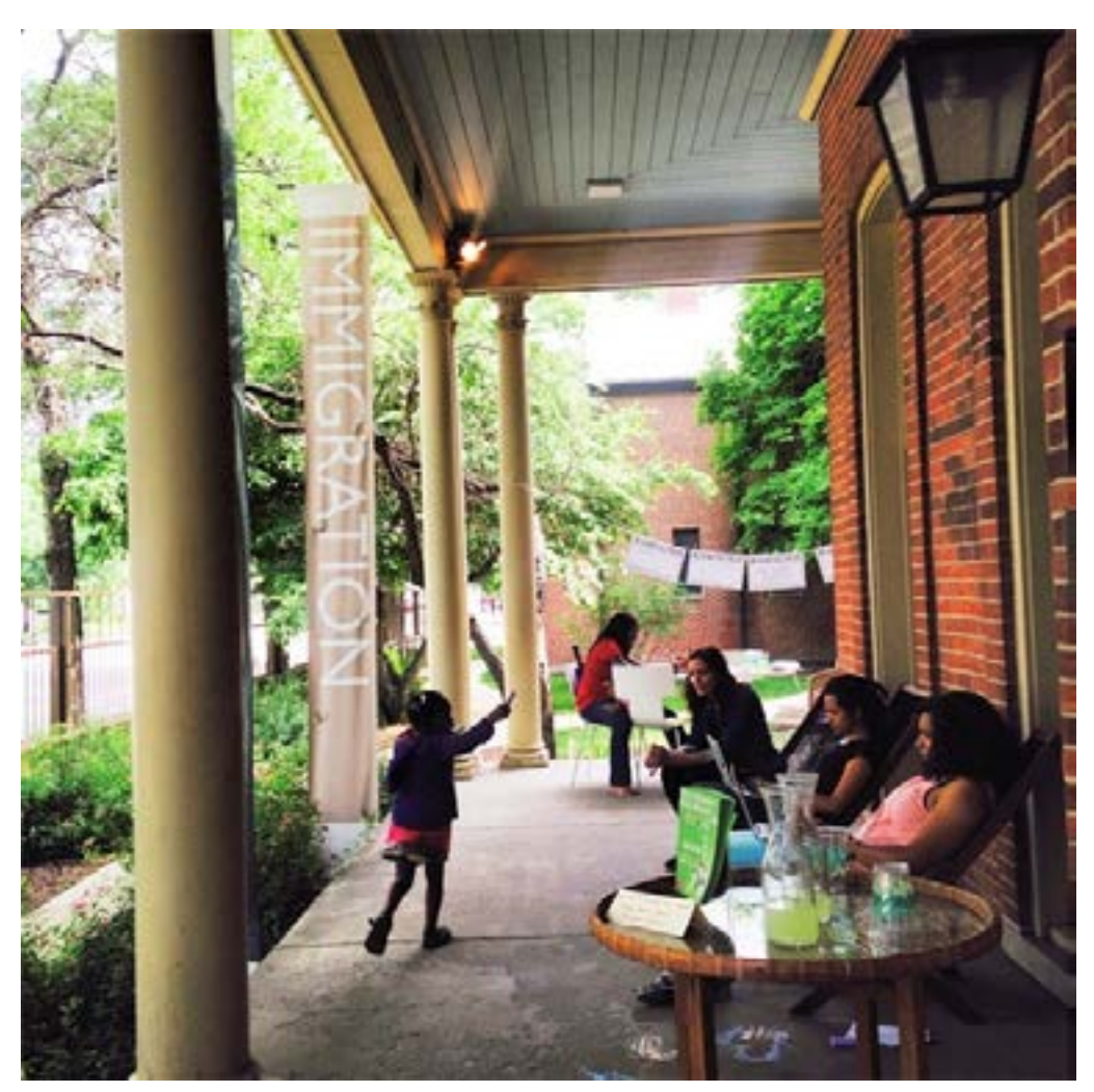
- The Porch was used for local meetings, informal dialogues, refreshments, community building and art activities