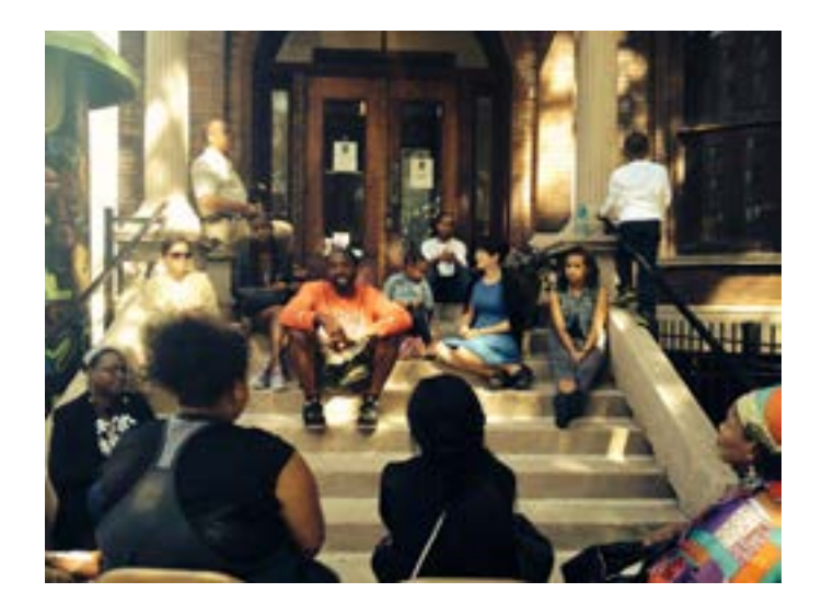
The Hull-House Museum brought its front porch programming to the South Side Community Art Center, where visitors discussed and demonstrated the African-Diasporic tradition of hair braiding, which is practiced on stoops, in kitchens, and in beauty salons across the globe.

It is hard to overstate the role that settlement houses played in establishing many of the social "safety net" services that today we take for granted. When Addams and Starr first opened Hull-House in 1889, they had very modest goals. Initially, they hoped to offer art and literary education to their less fortunate neighbors, but the Hull-House quickly grew beyond what either woman could have imagined. The settlement house continued to evolve to meet the needs of the community and soon, at the request of the surrounding community, Hull-House residents began to offer classes to help new immigrants become more integrated into American society, such as English language, cooking, sewing and technical skills, and American government. Hull-House became not only a cultural center with music, art, and theater offerings, but also a safe haven, a place where the immigrants living on Chicago's Near West Side could find companionship, support, and the assistance they needed for coping with life in the modern city. Hull House in Chicago, under Addams' fierce leadership, was a pioneer in establishing the first juvenile justice court, the first public playground,