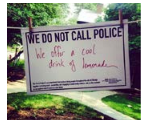
- Don't Call was a poster project rooted in conversations about police brutality in urban communities of color. It encouraged visitors to consider dynamics of safety, violence and community accountabili-